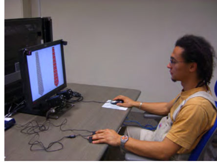
Fig. 2. Experimental setup

Subjects were seated in front of an 20.1 inch display with attached infrared lights (see Fig. 2) and their head and eyes were calibrated. This procedure has to be performed for each individual once, and takes approximately 5 minutes. (If a person wears glasses, the procedure might be prolonged to due reflection from the infrared light.) Next, the biometrical sensors of the ProComp Infinity encoder were attached to the subject. The SC sensor was attached to the index finger and the ring finger of the non-dominant hand, and the BVP sensor was fixed to the thumb of the same hand.